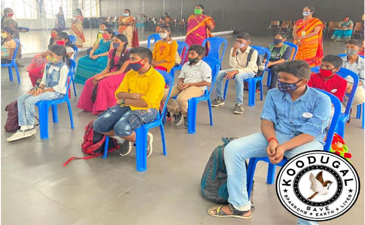
20.03.2021 - Velammal Vidyalaya, Paruthippattu