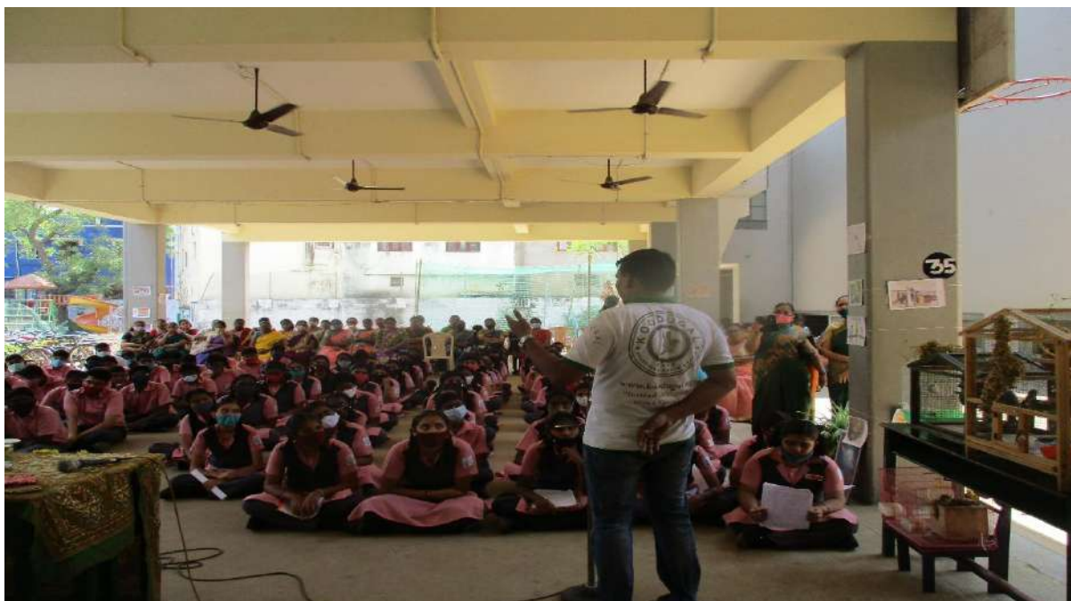
22.03.2021 - Kulapati Dr. S. Balakrishna Joshi Gurukulam CBSE Senior Secondary School, kolathur