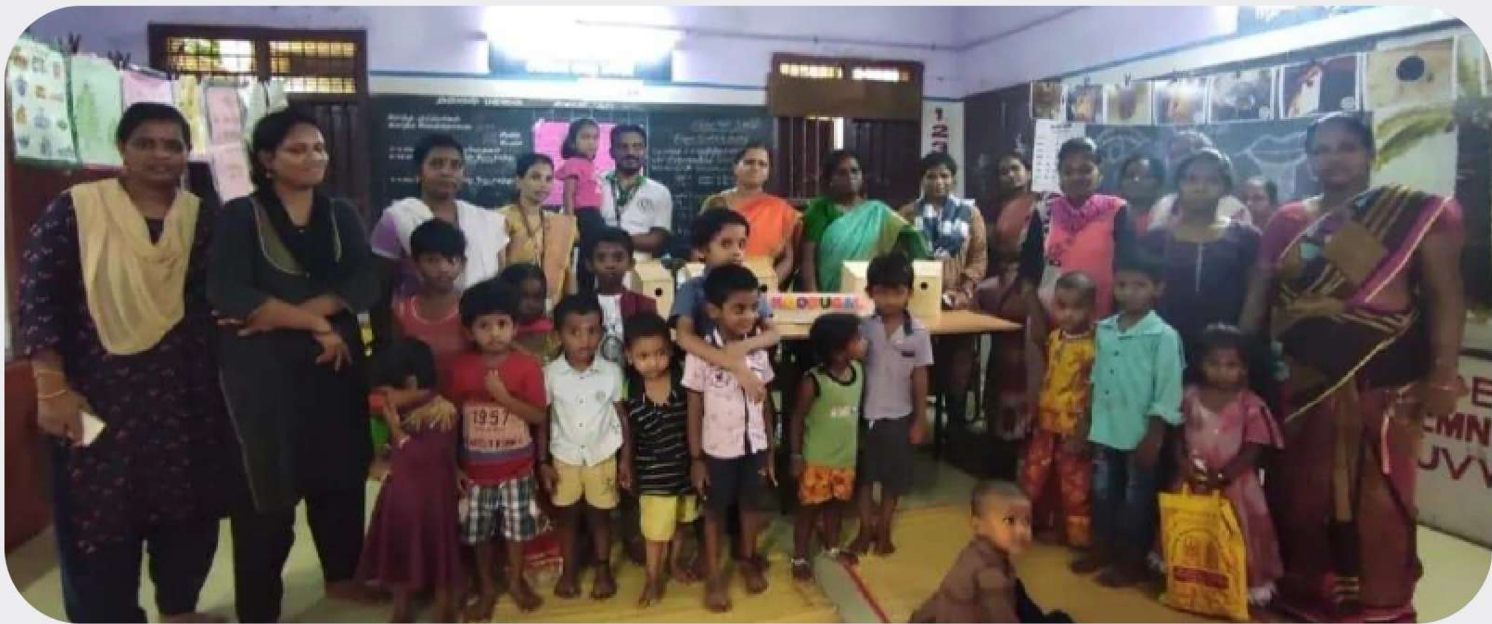
koodugal Awareness program & Nest installation in collaboration with ICDS, Govt of Tamil Nadu on 02.06.2022 @ Todiarpur, Chennai