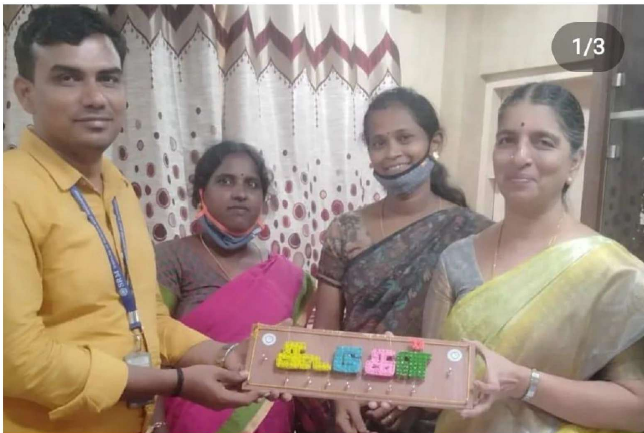
koodugal Awareness program birds Conservation on 22.06.2022 @ Shrimathi Devkunvar Nadal Bhatt Vaishnav College for Women, Tambaram, Chennai