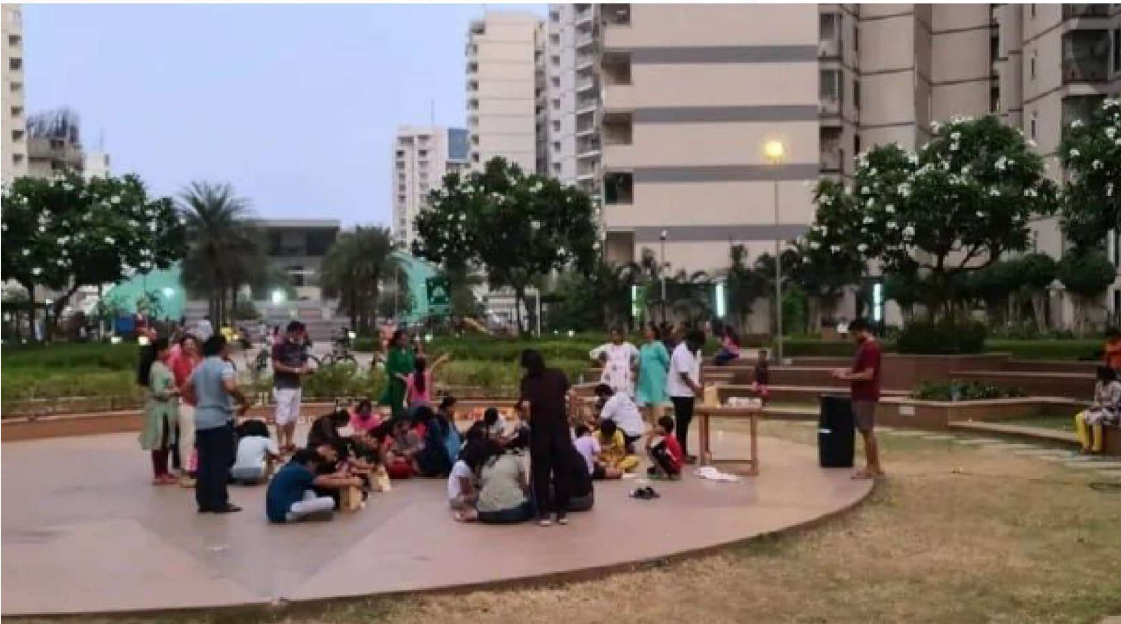
koodugal Awareness program & Hands on Training on 05.06.2022 @ Metrozone, Anna nagar, Chennai.