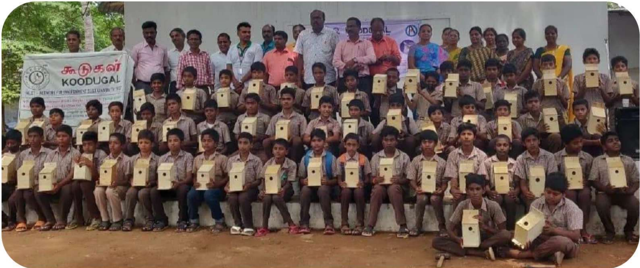
koodugal Awareness program & Hands on Training on 07.05.2022 @ St. Mary's High School, karumathampatti, Coimbatore.