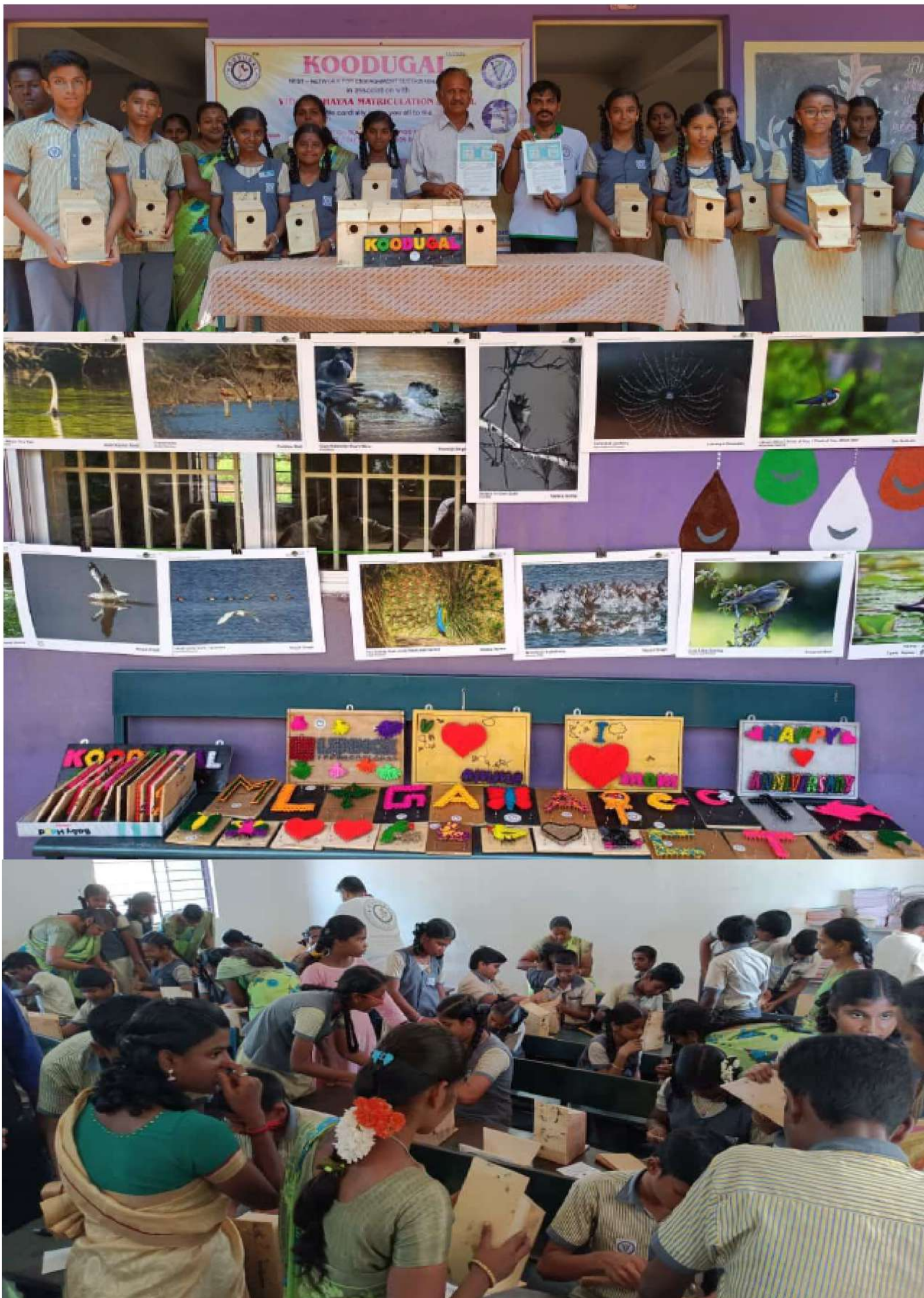
Workshop on making of Sparrow Nest, Awareness Program on Sparrow Conservation, Wildlife Photography & Sparrow Photography Exhibition and Seminar on Reducing Plastic gift through string Art and Displayed.n on 30.07.2022 @ Vidhyodhayaa Matriculation School, Dindugal Dt